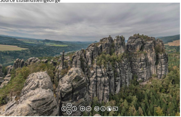
Panorama von der Schrammsteinaussicht Author Ottmar Vetter Source Elbsandsteingebirge