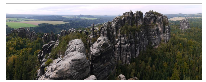
Schrammsteinaussicht Author Ottmar Vetter Source Elbsandsteingebirge