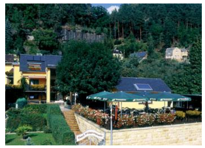
Hotel Elbpromenade Author Ottmar Vetter Source Elbsandsteingebirge