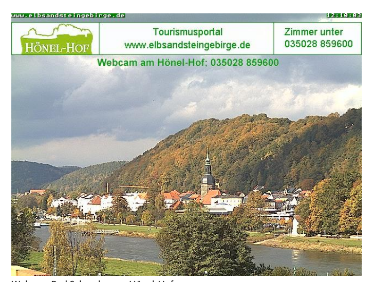
Webcam Bad Schandau am Hönel-Hof Author Ottmar Vetter Source Elbsandsteingebirge Verlag, www.elbsandsteingebirge.de